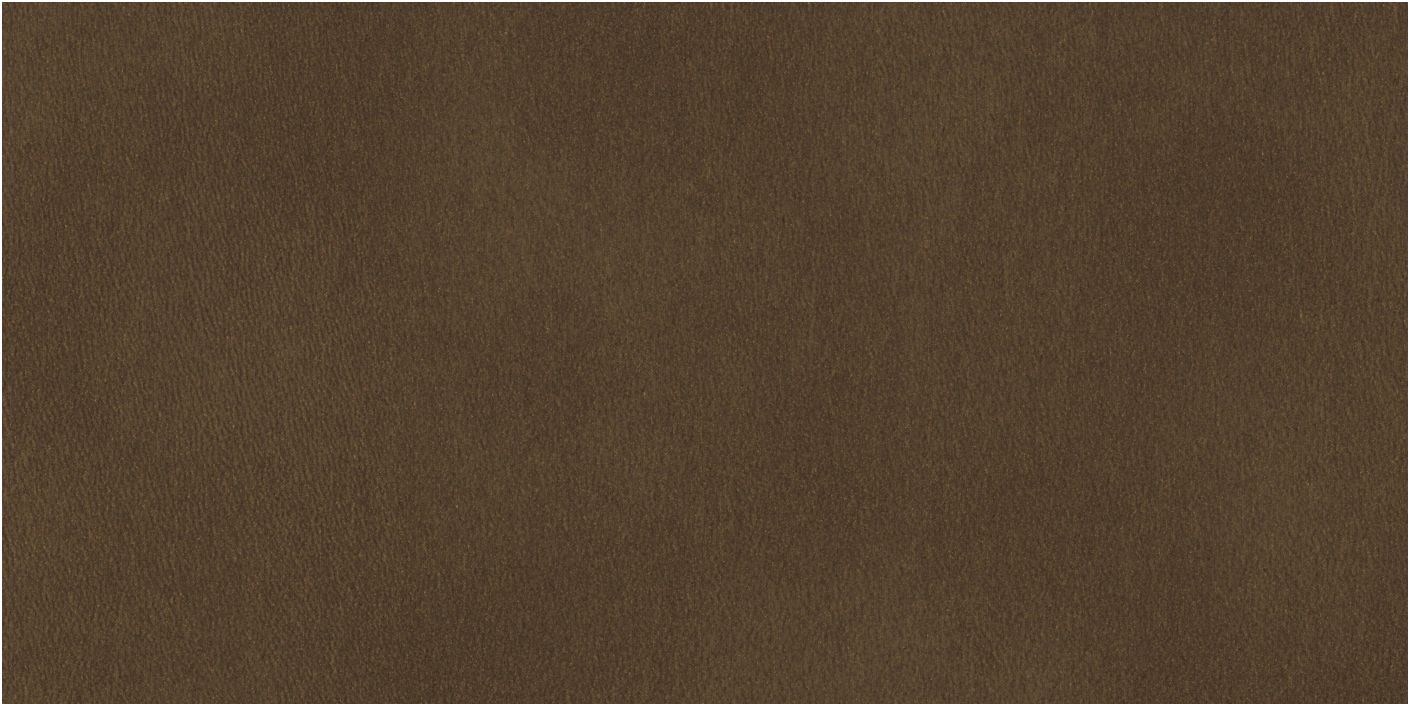
NAB8972 MARRON DORÉ

The color may deviate from the original. | 1 cm |